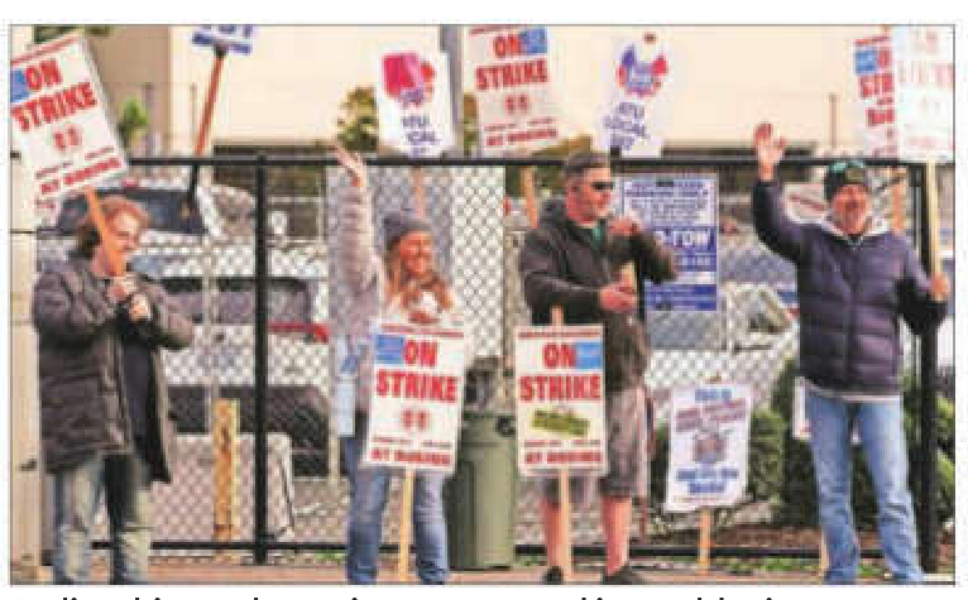
Earlier this week, Boeing announced it would raise up to $24.3 billion to shore up its battered finances

NOMURA HOLDINGS' PROFIT rose more than analysts expected last quarter, buoyed by strong results across its businesses including wealth management, trading and investment banking. Net income more than doubled from a year earlier to ¥98.4 billion ($645 million) in the three months ended September 30, Japan's largest brokerage said in a statement.