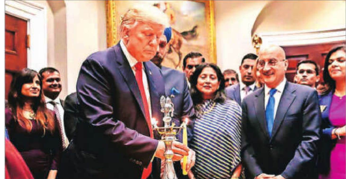
Republican presidential candidate Donald Trump said he will strengthen great partnership with India under his administration

"I'm very grateful to President Trump, eternally grateful and eternally appreciative. It sucks that Kamala Harris hasn't said anything about this issue. I think that there's going to be a big change in this elec-