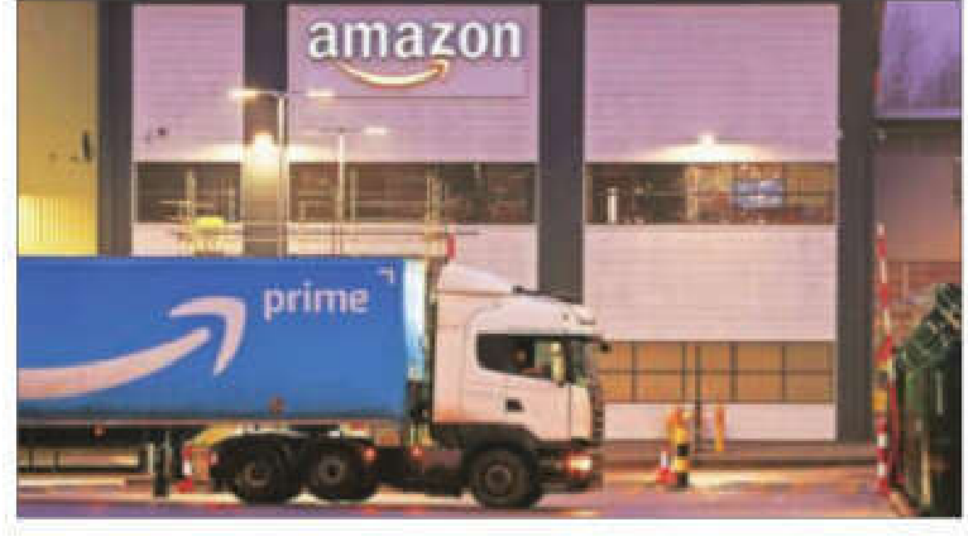
BEATING Q3 EXPECTATIONS

AMAZON.COM REPORTED STRONG results that showed a company humming on all cylinders, a testament to its efforts to cut and reallocate costs and put the cloud computing and e-commerce giant on sounder footing. The Amazon Web Services cloud division, which suffered record low sales growth last year, continued to regain momentum during the third quarter. The online retail operation, which sputtered coming out of the pandemic, grew unit sales by double digits. So did revenue at Amazon's fast-growing advertising business.